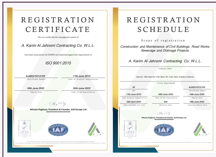
ISO 9001:2015 QMS Certificate Quality Management System

Quality, Environment and Safety are paramount for AJKC, evident in its commitment to continuous improvement and adherence to stringent QHSE standards. This dedication has secured long-term partnerships with esteemed entities like Bapco Refining, Bapco Gas, Bapco Upstream, Bahrain Defence Force (BDF), Electricity and Water Authority (EWA), Ministry of Education (MOE), Ministry of Interior (MOI), Ministry of Works (MOW).