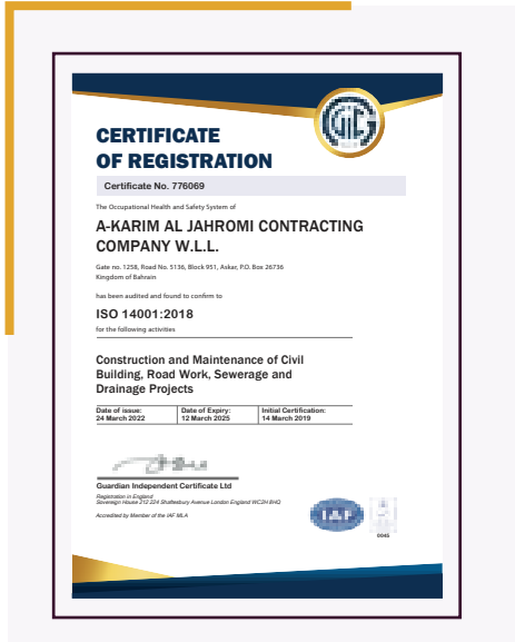
ISO 45001:2018 OHSMS Certificate Occupational Health & Safety Management System