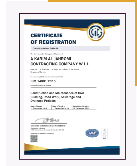
ISO 14001:2015 EMS Certificate Environmental Management System